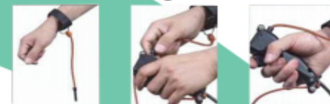
(picture 3) (picture 4) (picture 5)